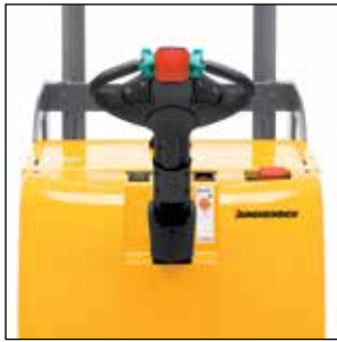
Ergonomic operating handle