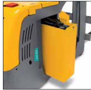
Lateral battery exchange (optional)