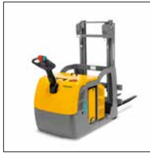
Excellent view of the load for precise positioning