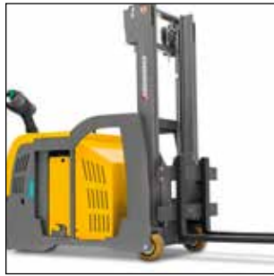
Increase in ground clearance with large load wheels