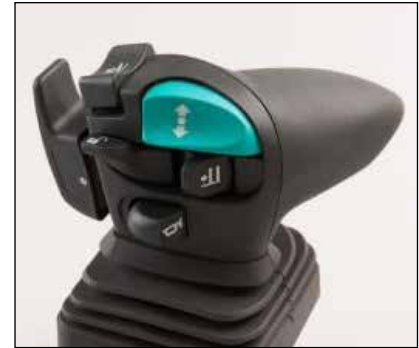
multiPILOT control (optional)