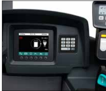
Easy-to-read color display