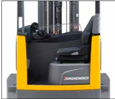
Five different steering modes